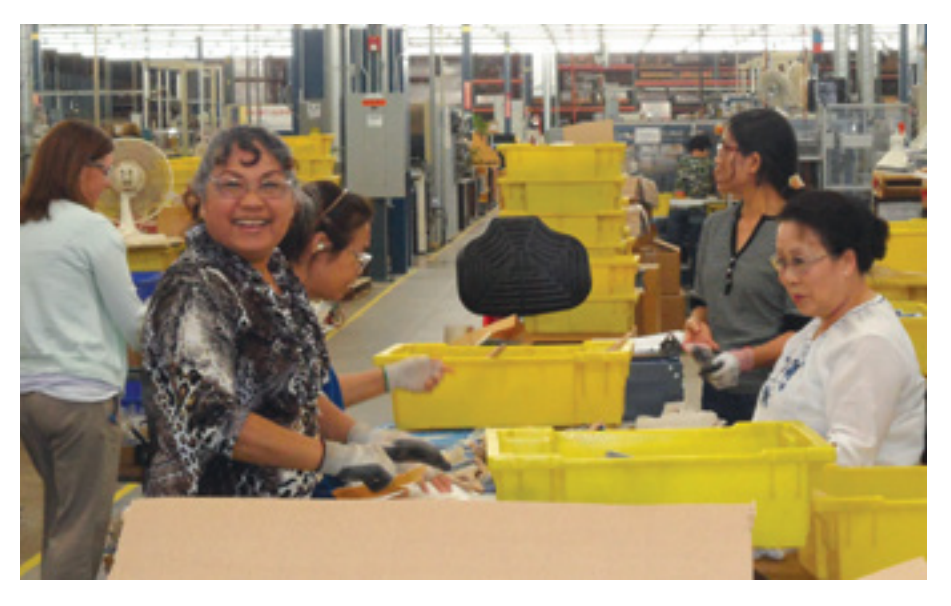
This vision for future service calls for improvements that would make it easier to access industrial and manufacturing jobs, such as the ones shown here at Purdy Brush in the Rivergate Industrial Area of North Portland.

Our transit network today does a good job bringing people into and out of Downtown Portland. Downtown will continue to be an important