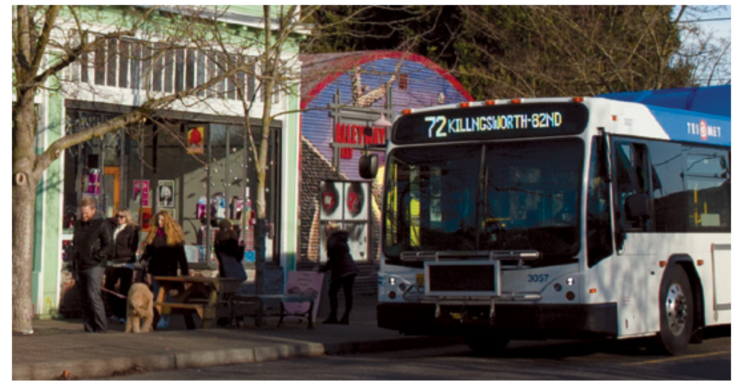
Many neighborhoods throughout North and Central Portland were developed at a time when transit and walking were people's primary modes of transportation. Transit service continues to be vital to maintaining quality of life in these areas today.

In this phase, we asked people to give us all of their ideas for ways to make transit better. The response was resounding: new bus routes, more frequent service and more hours of service. We heard from over 3,000 survey respondents and hundreds more through in-person meetings including a community forum in North Portland, emails and phone calls. During this