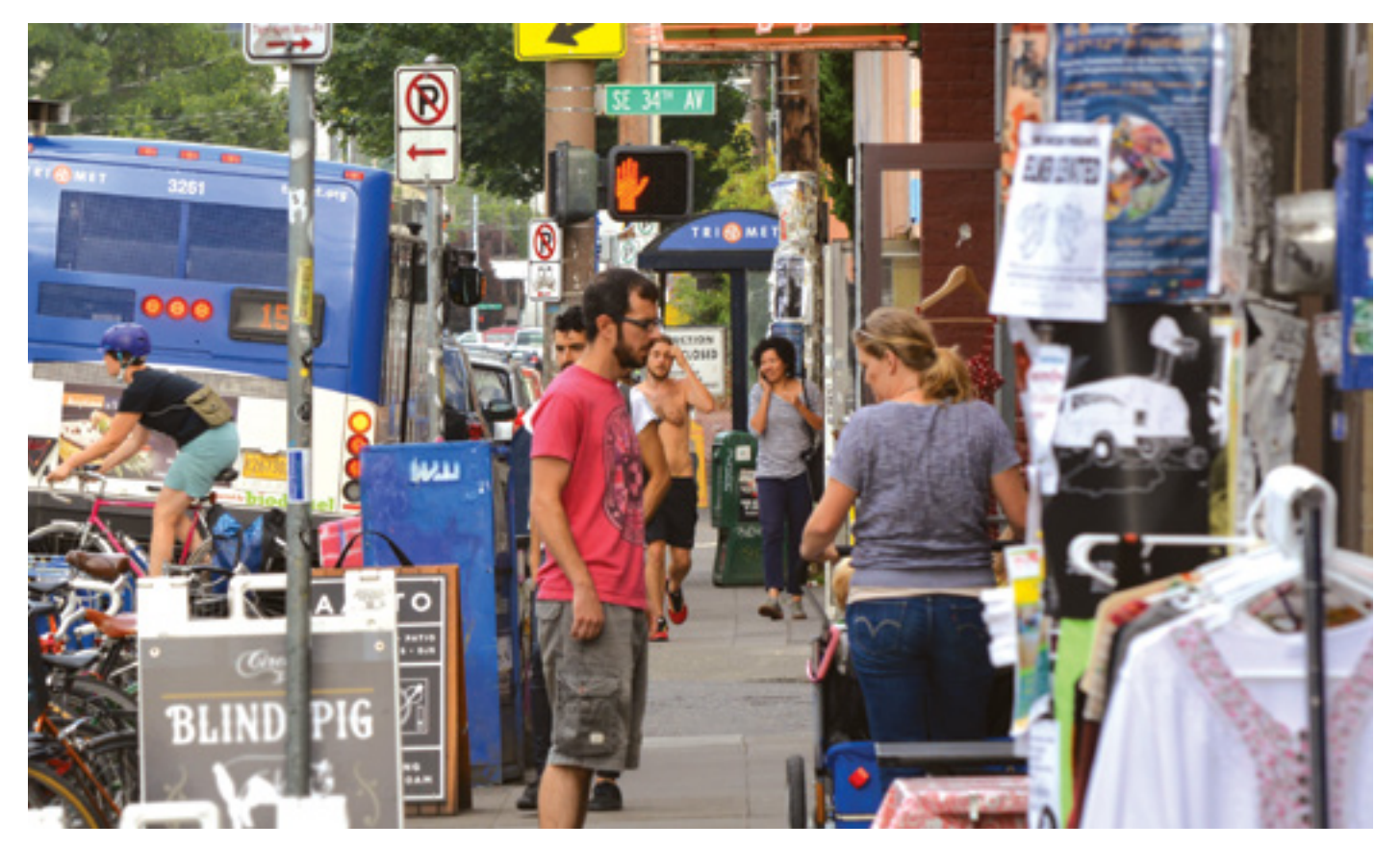
Transit service is an integral part of life on Southeast Belmont now and will continue to be in the decades to come.

Transit has been an integral part of the communities in North and Central Portland since the time they were founded. Transit service needs to grow as these communities continue to grow. Implementing the vision put forward in this plan will support mobility and quality of life in North and Central Portland in the decades to come.