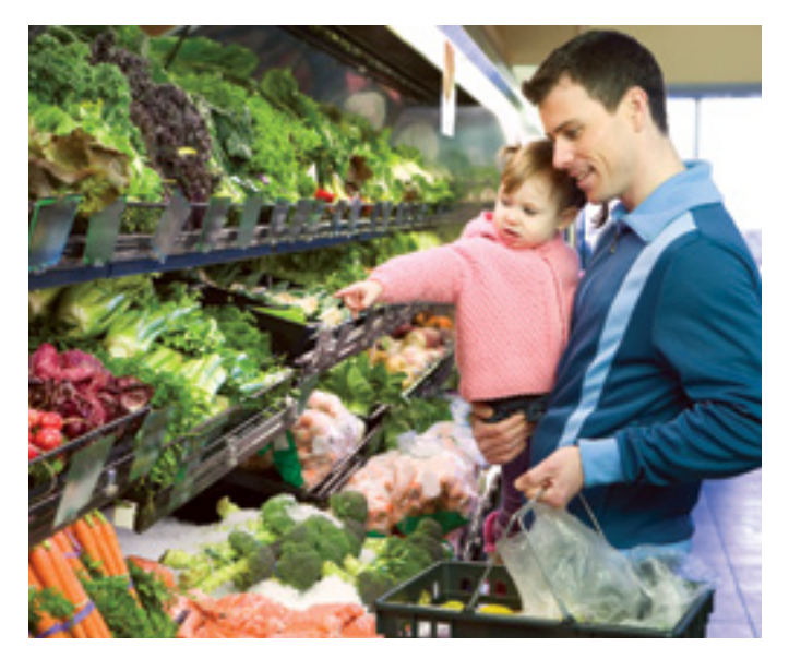
This vision for future service would make it easier for people to access key services like grocery stores, such as the Albertsons in the Cully neighborhood and the Wal-Mart in the Delta Park shopping center.