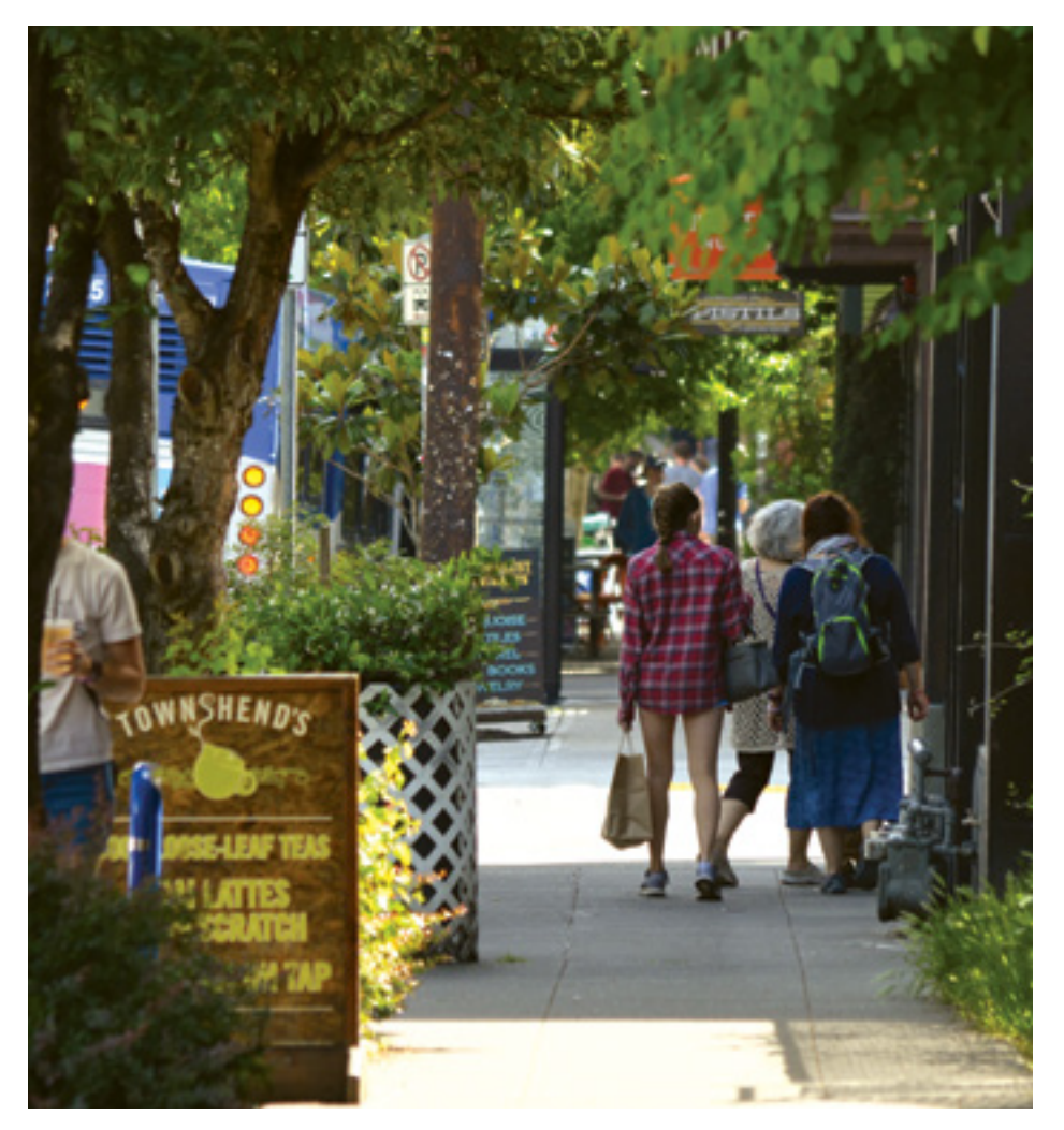
Line 4 on North Mississippi Avenue is one of the most ridden bus lines in the entire TriMet network today. This vision for future service calls for later and earlier service on Line 4.

Many of our bus lines today function well, but would be more useful to riders with more frequency. As part of our standard practice, we regularly