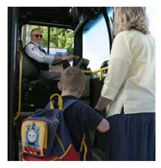
This vision recommends service enhancements that would improve access to education.

To help our riders get where they need to go quickly, efficiently and with minimal delay, we'll continue to work with cities, counties, and the